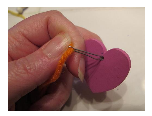
5.) If desired, bead the necklace. Tie ends securely and it's ready to wear!

4.) String the hearts with the yarn. If the drill hole is small, you can make a threader by folding some thin wire in two.